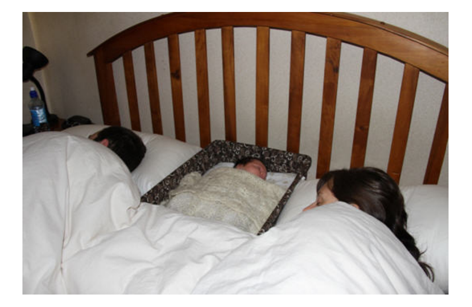
Figure 2. Pepi-pod provides a safe sleeping space for baby while co-sleeping

The ideal of course is to identify ways that would enable parent and baby to sleep safely together in the same bed. This is the focus of Nationwide SUDI Case-Control Study which has been just been funded by the HRC.<sup>21</sup>